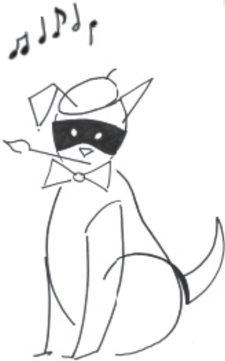
artwork: nicole hebert

fiber arts • painting • drawing • design • martial arts • dance • music • drama • writing • yoga • culinary arts • tech arts and more!